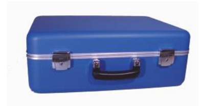
The console comes with a case containing all accessories